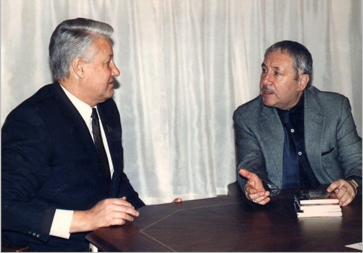
Ernst Neizvestny & Boris Yeltsin