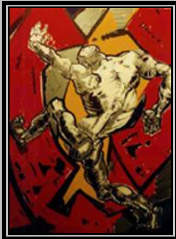
MAN THROUGH THE WALL