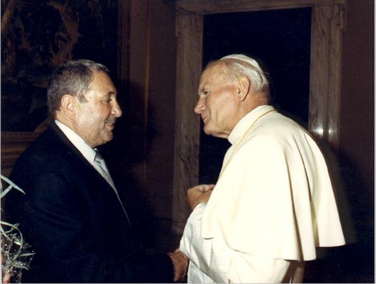
Ernst Neizvestny & Pope John Paul