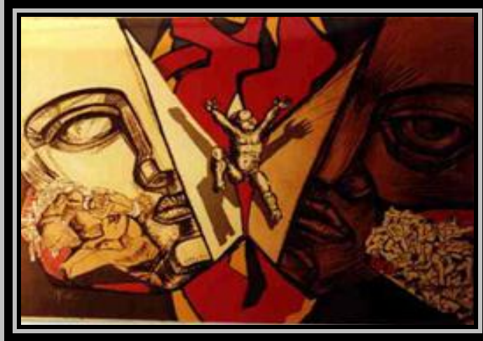
WALL OF APARTHEID