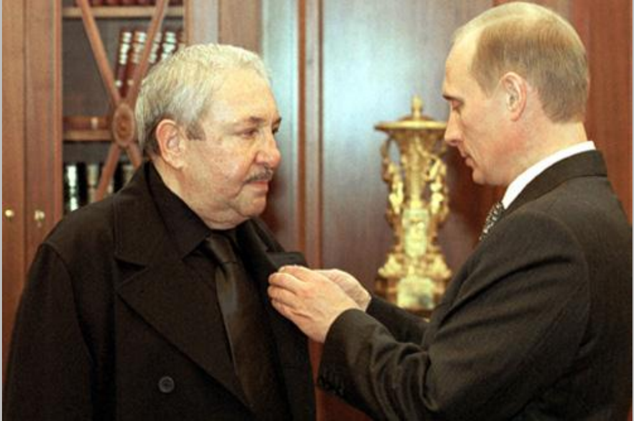
Ernst Neizvestny decorated by Vladimir Putin